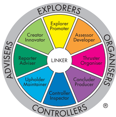
Team Management Wheel

Understand how you like to work, and how this may differ from others you work with.