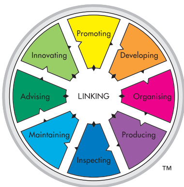
Types of Work Wheel

The Team Management Profile (TMP) is not just about psychometrics, it's about learning. Constructive, work-focused feedback helps individuals understand why they work the way they do, and how they can develop strategies to improve the way they work with others. It provides individuals with a common language and allows team members to recognise each other's strengths in the workplace. When used effectively, the TMP can improve performance at all levels of an organisation, enabling positive, lasting change.